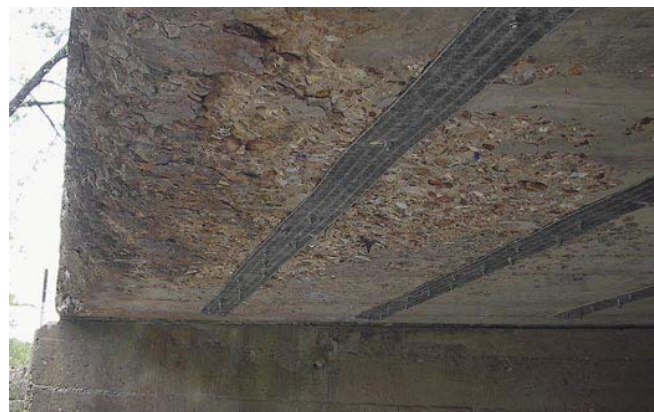
As a result of a SAFSTRIP® retrofit, the existing 12-ton load posting for this bridge in Phelps County, Missouri, was removed.

3 Modulus design values are not reduced in accordance with ACI 440.2R-02