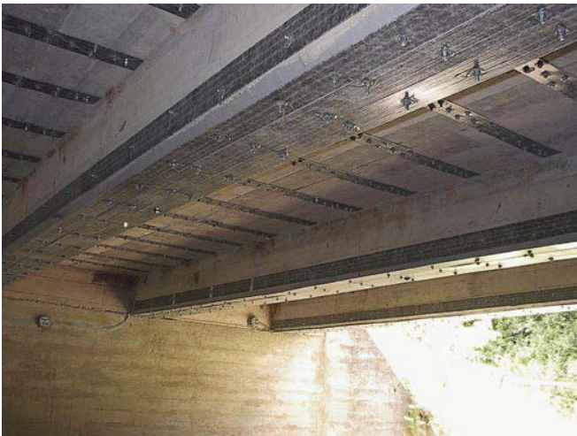
The posted load for this bridge that spans the Meramec River in Missouri was increased from 10 tons to 18 tons by installing SAFSTRIP® using the MF-FRP system.