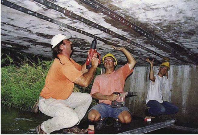
Workers installed SAFSTRIP® on this bridge in Edgerton, Wisconsin, using the MF-FRP system. The load rating for the bridge increased from HS-17 to HS-25 as a result.