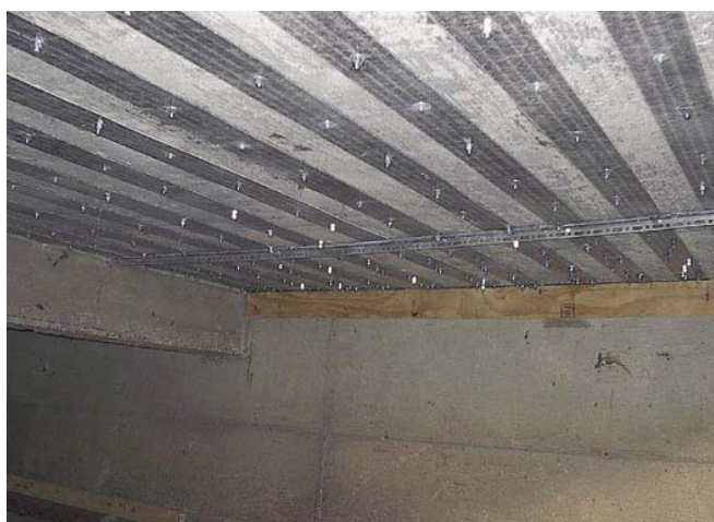
This bridge, located in St. James, Missouri, was load posted at the time of strengthening. After mechanically attaching SAFSTRIP® with concrete wedge bolts and anchors, the bridge load limit was raised to 20 tons.