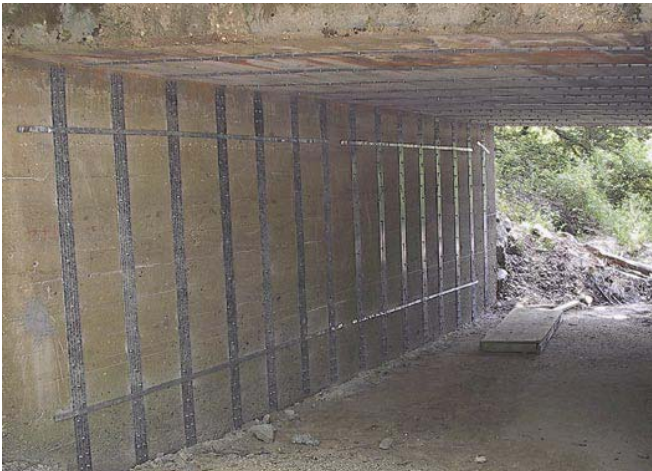
The abutment and deck of this bridge in Phelps County, Missouri, was strengthened using SAFSTRIP®.