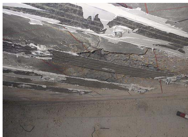
Severe deterioration prevented the application of a bonded strengthening system to this bridge in Pulaski County, Missouri, but MF-FRP applied SAFSTRIP® was able to repair the bridge.